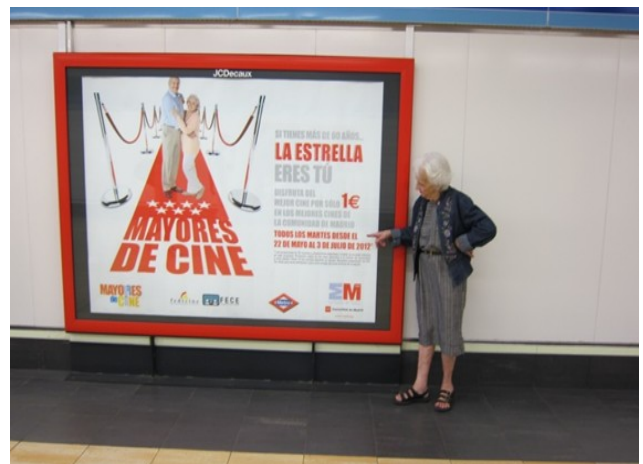
'The Star is You' – Older people go to the cinema for €1 every Tuesday