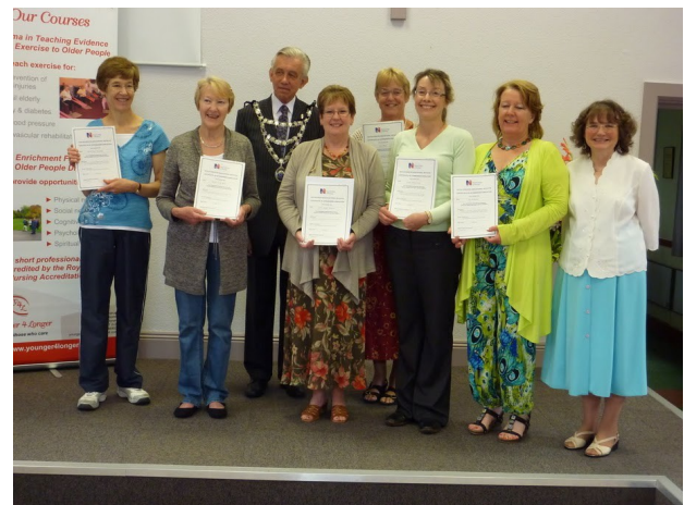
Last year's students receiving their Diplomas from the Mayor of Wimborne