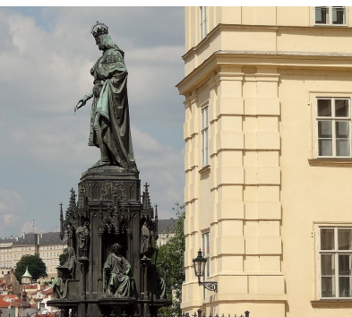
King Charles IV

In spite of the frustrations and disappointments, the IFA al-