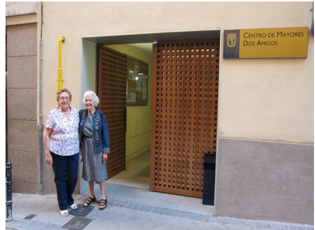
The newly opened 'Two Friends' Day Centre